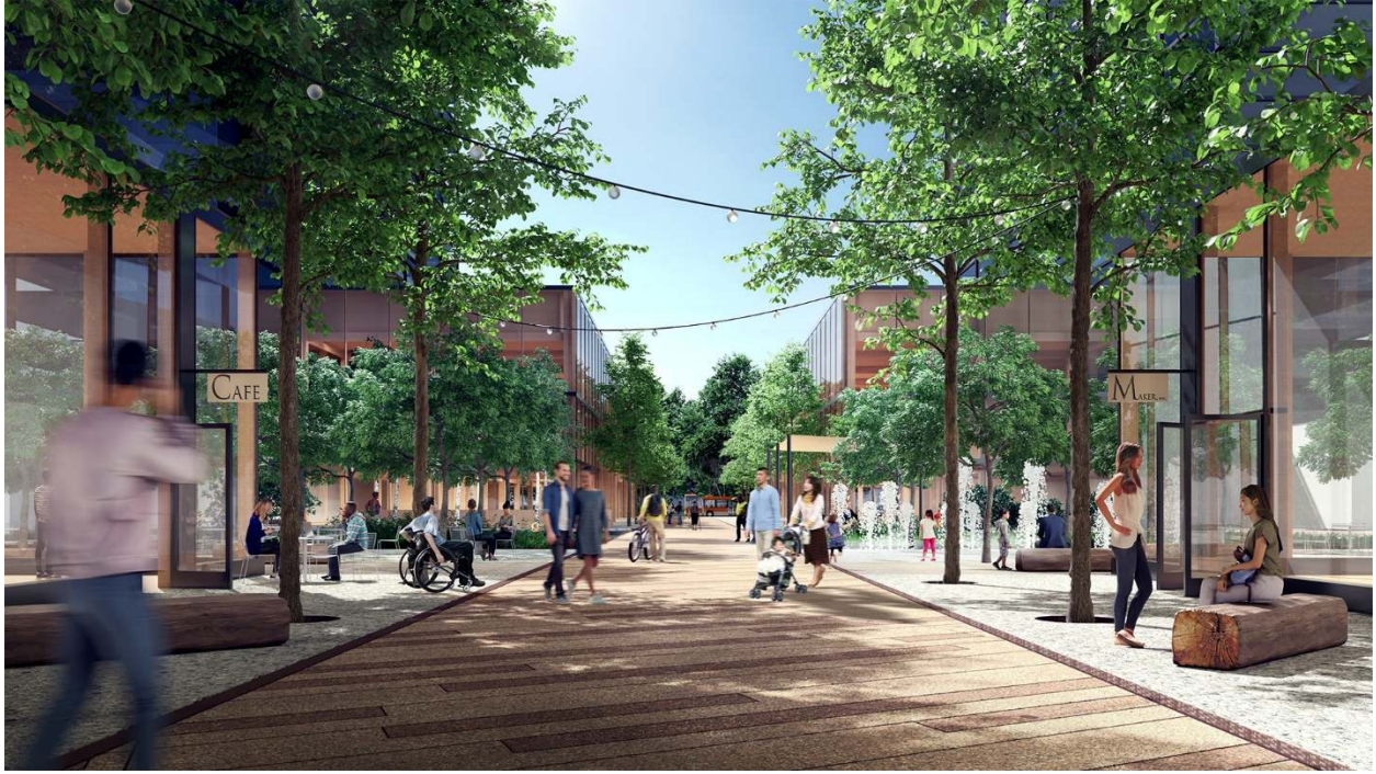
12 th Ave Promenade